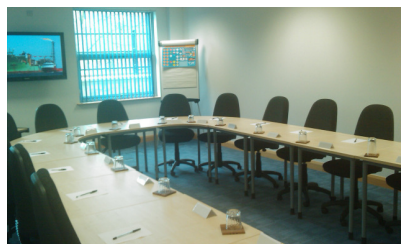
Training facility at QHSE Solutions, Bridge of Don, Aberdeen

We use various training facilities and can locate the training at a site to suit your company.